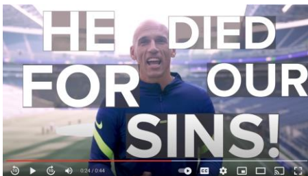
GMO ran ads during the World Cup in English, Spanish, and Portuguese with a former professional soccer player who is now a pastor.

GMO places ads on search websites and social media channels to direct seekers to a gospel presentation on a website in a language they understand. These tell the Christian message in culturally relevant ways and give